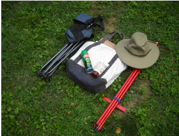
Packed plein air watercolor painting gear

In addition to the equipment needed to sketch and paint, there are important items that should be included for comfort as well. A hat, sunscreen, insect repellent are almost always required for painting outdoors. If you like to paint sitting down, a lightweight campstool or camp chair is a good idea. An easel is a good idea if you prefer to sit while painting. If you stand to paint, it is an absolute must. There are a number of different easels available for the watercolorist. There are light weight metal and wood easels which will hold mounted paper or a watercolor block in a horizontal position. French easels are popular with many artists. They are more substantial and include built in storage as well as areas to place palette, brushes and other materials while painting. Both types of easels are adjustable in height and can be used while seated or standing. No matter what equipment is chosen for your outdoor painting, the number one rule is that it should be as light as possible, easily packed and transported.